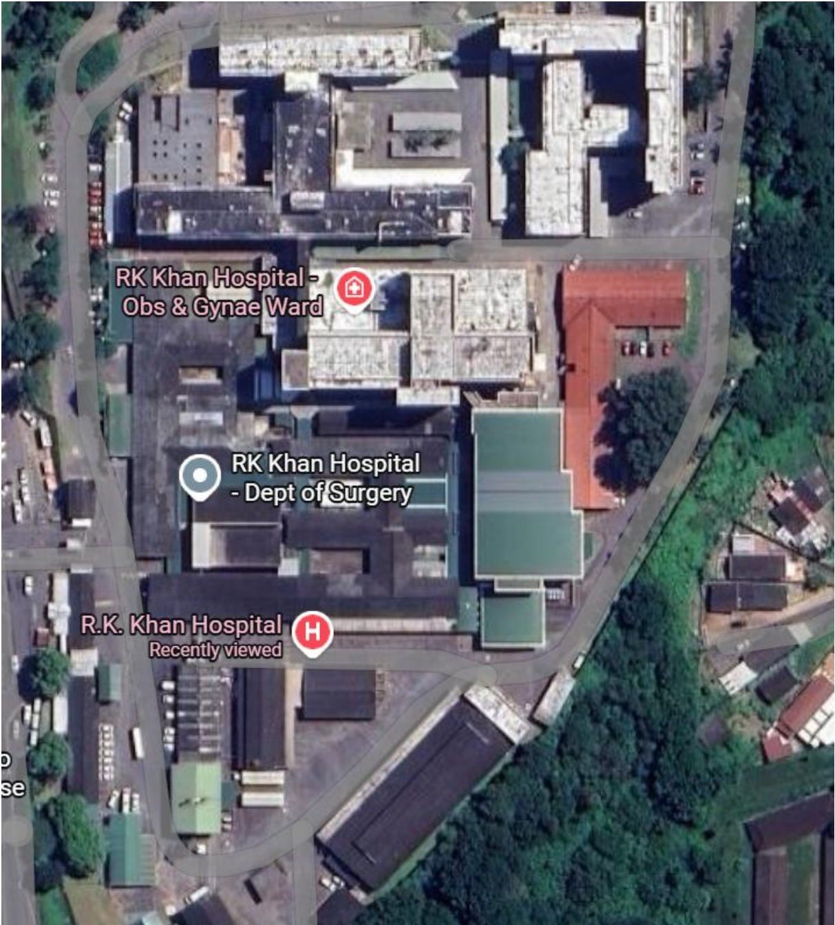
Figure 2: RK Khan Hospital Precinct